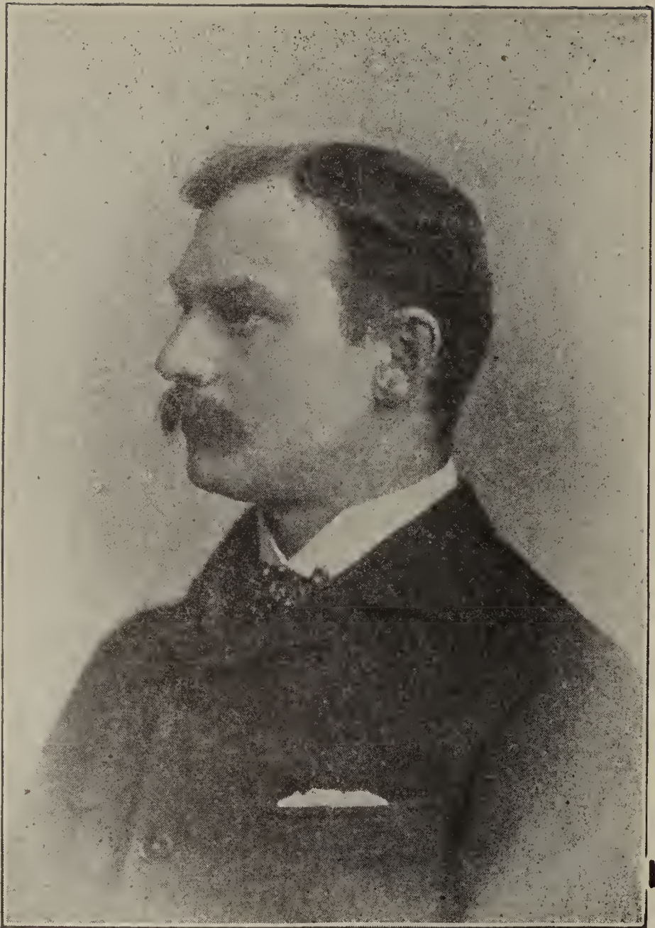
JEROME K. JEROME.